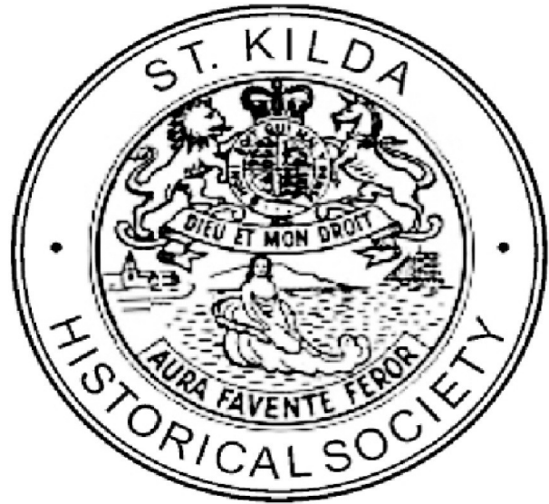
Logo St Kilda Historical Society