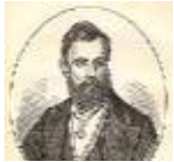
Baron von Mueller 1825-1896