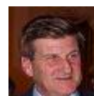
Jeff Kennett Premier VIC 1992—1999

Anyone fascinated by this naval officer and willing to compile some biographical information about him, do contact SKHS Committee on info@skhs.org.au .