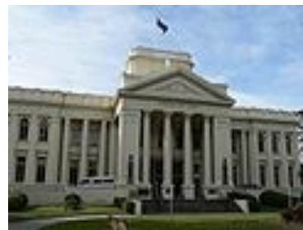
St Kilda City Hall

... Although some of Pitt's grandest buildings have since been demolished ... some fine examples of his architectural work remain — The Princess Theatre; the former Bryant & May Factory in Richmond plus others — and William Pitt is still strongly associated with the boom era of Marvellous Melbourne.