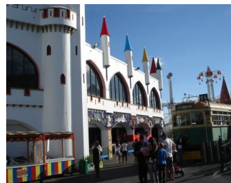
Luna Park qwkpix: FBader Dec2010.