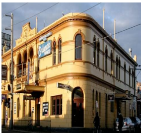
Image: J. Hulskamp, 2004, Pots, Punks & Punters , SKHS Online Publ. 2004