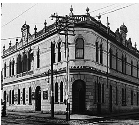
Village Belle 1912