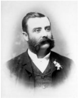
William Pitt, Architect