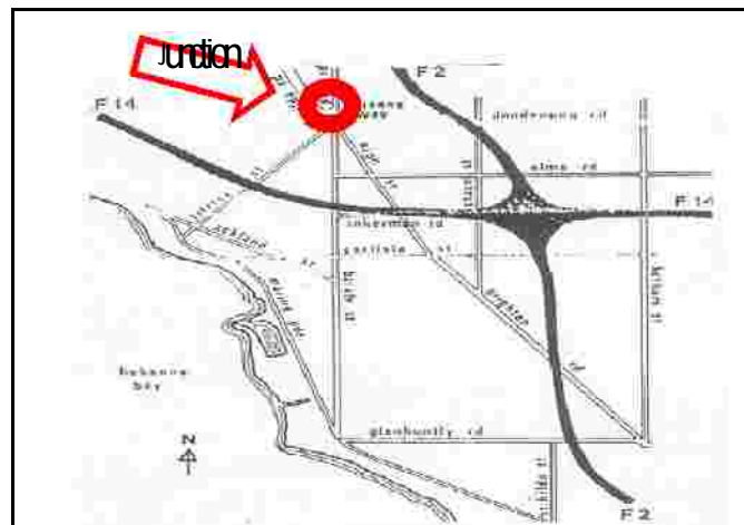
Two other proposed freeways thru St Kilda in 1970s

SKHS was mainly established to help raise awareness of, and document St Kilda's fast-disappearing heritage after Queens Rd was reconstructed (completed 1968).