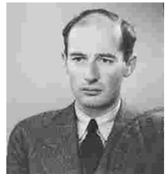
Raoul Wallenberg Passport Photo

A memorial tree, plaque and reflection seat initiated by the local Wallenberg Committee and installed in Raoul Wallenberg's memory in the forecourt of St Kilda City Hall (pic on right) is inscribed with the Hebrew axiom: "Whoever saves one life saves the world".