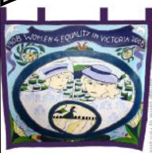
Illustration by Fern Smith

Some SKHS members will be 'soapbox' extras