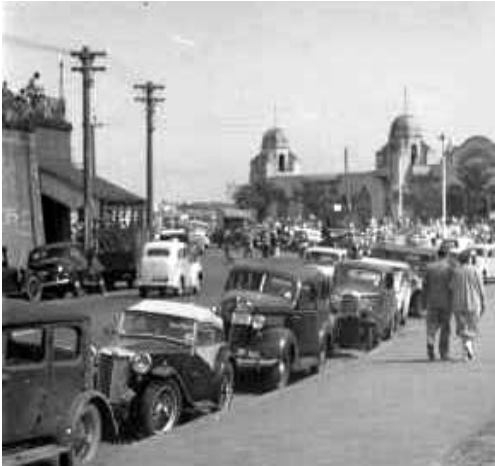
black & white images (cropped) left: c.1948 [with verandah posts] right: March 1952 [no verandah posts]