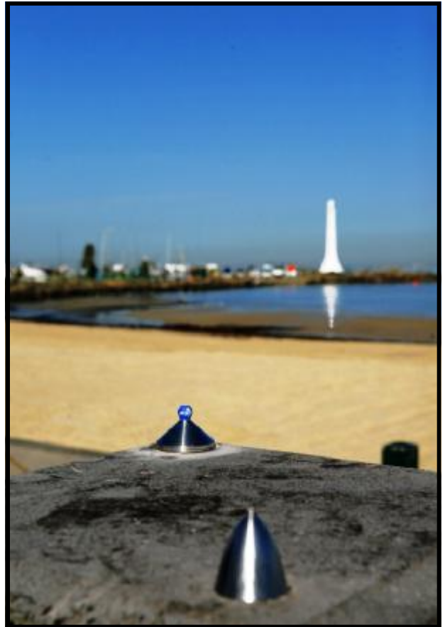
Planet Earth Installation

The sunstar replica, weighing 350 kg and measuring nearly 1.5 metres across, is located north of St Kilda Lighthouse. Earth, the '3rd rock from the Sun', is about the size of a marble and located 150 metres away (FB)