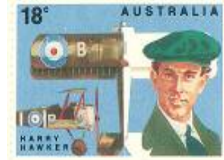
Harry Hawker postage stamp

a test pilot, and so, with two other test pilots employed by the Sopwith Aviation Co., he began testing 'Tabloids', 'Pups', triplanes and 'Camels' for use in WWI.