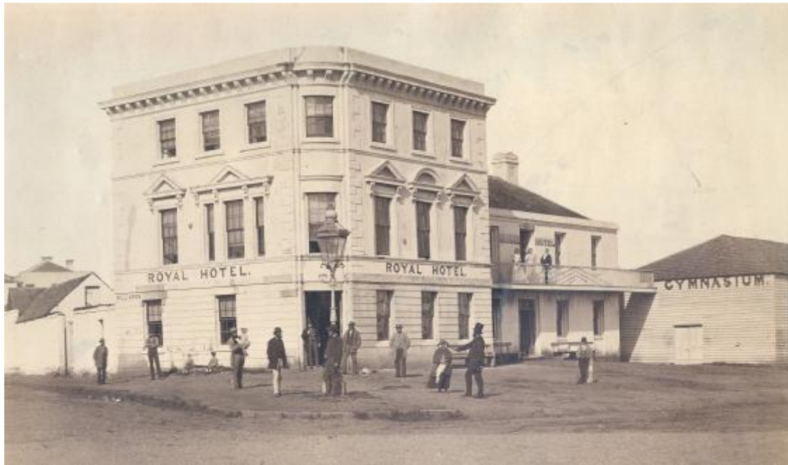
Royal Hotel corner Robe Street and the Esplanade, 1864