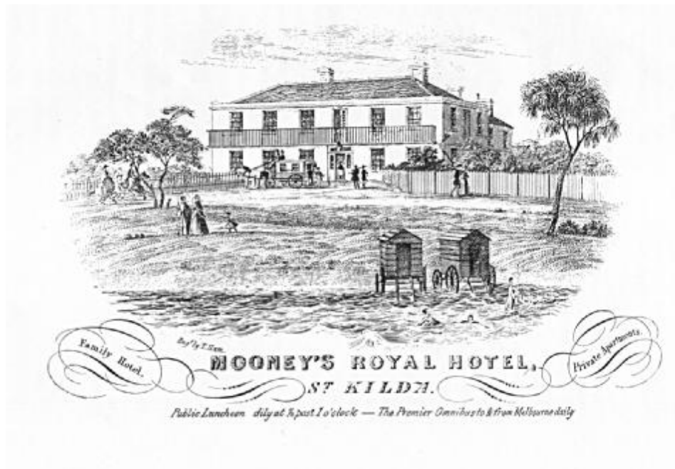
Early impression of the Royal Hotel

Royal Hotel/ Family Hotel 1847 – 1930s 22 The Esplanade, corner Robe Street, St Kilda MEL: 58 K10