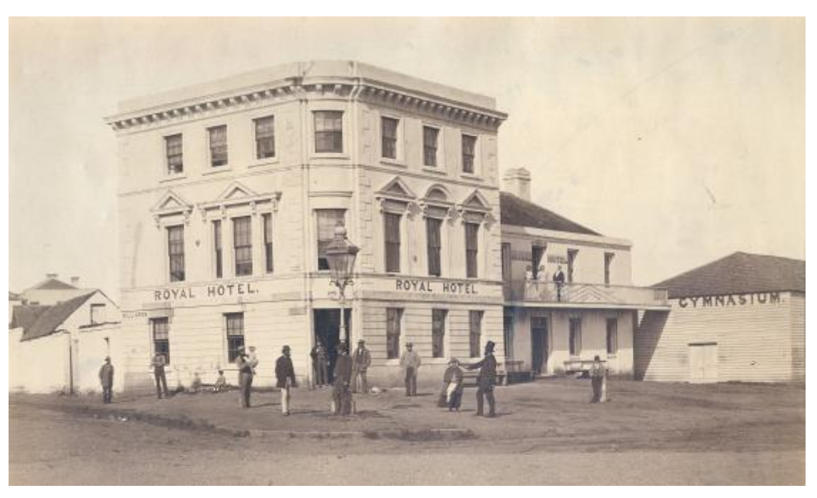
Royal Hotel corner Robe Street and the Esplanade, 1864