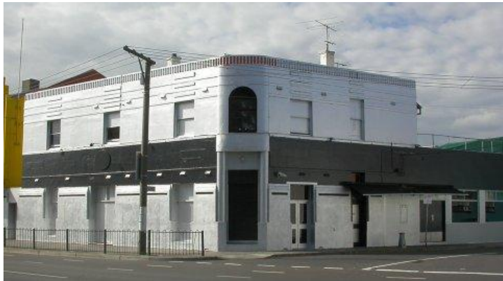
Duke of Edinburgh Hotel, 2004

Quench your thirst on a dusty road to Brighton