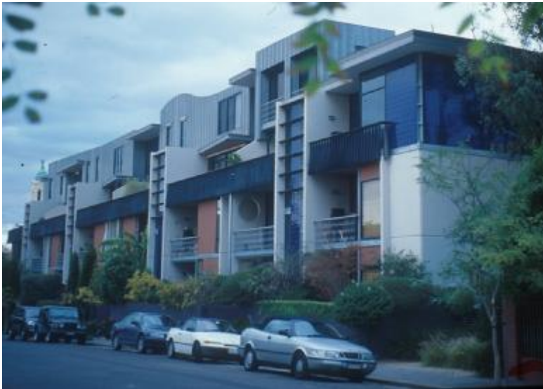
St Leonards Apartments, 2002

In St Leonards Avenue, prodigious and creative architect Nonda Katsalidis has contributed a recent chapter to the century-long story of apartment design in St Kilda. Yet these apartments develop their form from the characteristic Melbourne terrace, several of whose earliest examples, such as Elwood House (40) survive in St Kilda.